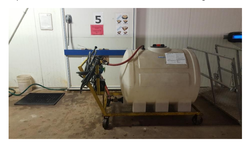
However, there is much quicker and simpler method using a Dosatron Unit

MycroNutrient needs to be diluted before use and most growers use a Dofra type tank